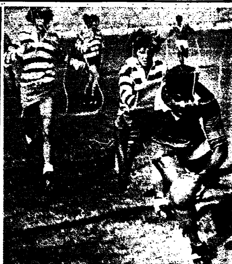
A Fijian UNIFL rugby player goes through for a try in Jerusalem yesterday, as the Fijis overwhelmed a Hebrew University Invitation XV by 74-0.

Queens Park Rangers and Leicester both moved up level with Newcastle ahead of them on goal difference. (AP, Reuters).